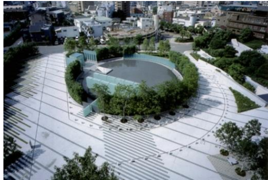
Former Air-raid Shelter for Prefectural Headquarter in Nagasaki Memorial Hall for Atomic Bomb in Nagasaki