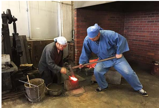
Tatara Furnace in Oku-izumo