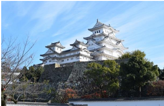
Himeji Castle (UNESCO World Heritage Site)