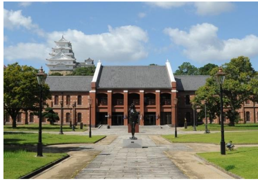
Himeji Municipal Museum (Former Army Warehouse)