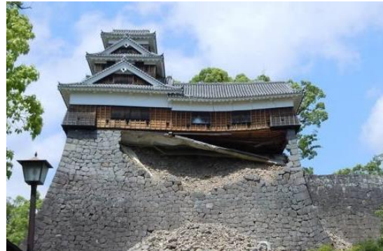
Ancient Hara Castle (Christian Stronghold of the 17th Century) Kumamoto Castle after the Earthquake of 2016

The detail of the post-conference tour will be announced at the end of May. Those who want to participate in the tour will be requested to register and pay the travel expense before the end of August.